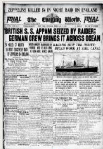
The evening world. (16pp.) New York, N.Y.