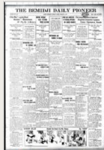
The Bemidji daily pioneer. (4pp.) Bemidji, Minn.