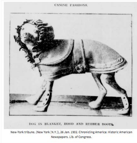
New-York tribune. (New York [N.Y.]), 26 Jan. 1902. Chronicling America: Historic American Newspapers. Lib. of Congress.

As Delaware and the rest of the northeast brace for the upcoming blizzard, a quick, snowy stroll through 1902 might give us some ideas on how to prepare. According to the New York Tribune from January 26, 1902, New York City dogs prepared for the snow in fashion: